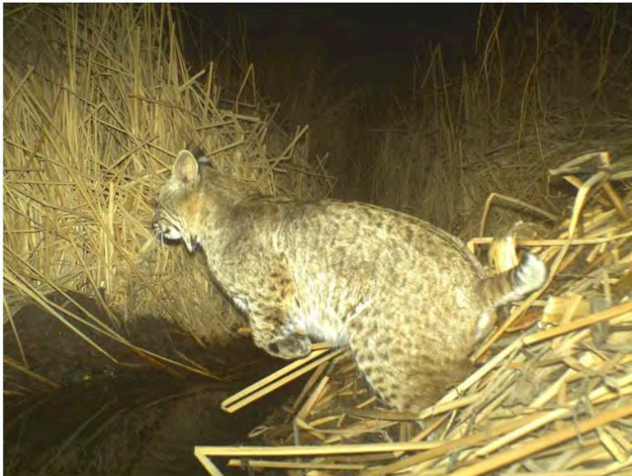
Bobcat crosses the gap in a mini beaver dam in the cattails in Rio Bosque Wetlands Park, Jan. 5, 2023.